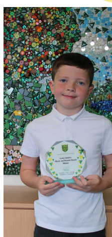
Above and Beyond